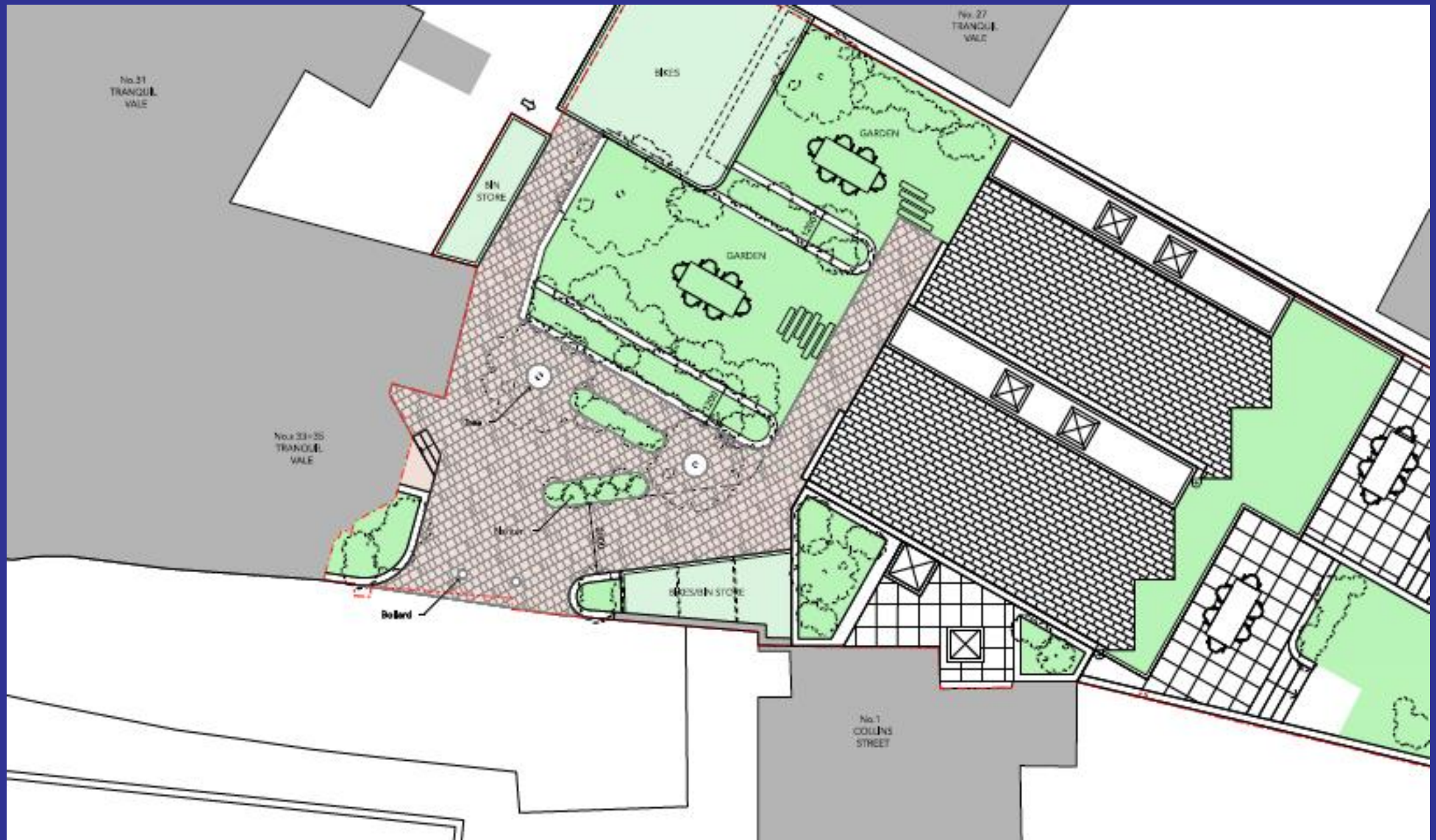
Revised proposed soft and hard landscaping