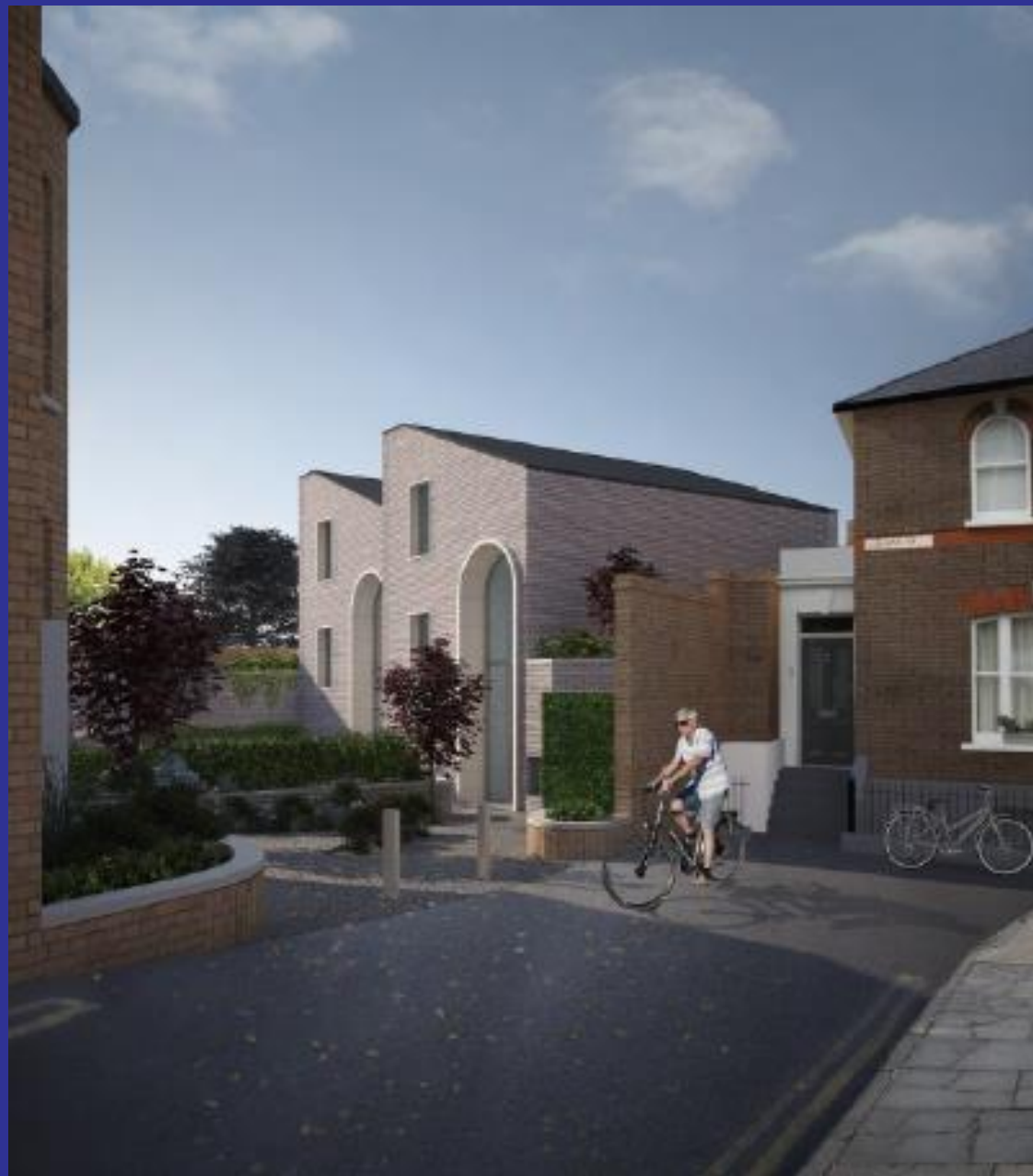
Proposed revised front area